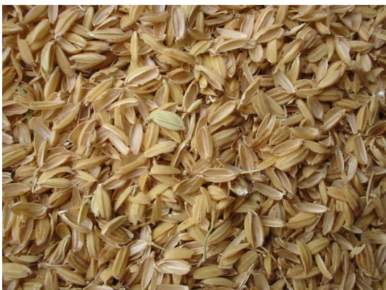
Rice husk used as a source of energy.

For more information about the project, please refer to the CDM project 4078 at UNFCCC website: